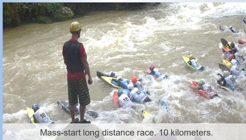
Mass-start long distance race. 10 kilometers.