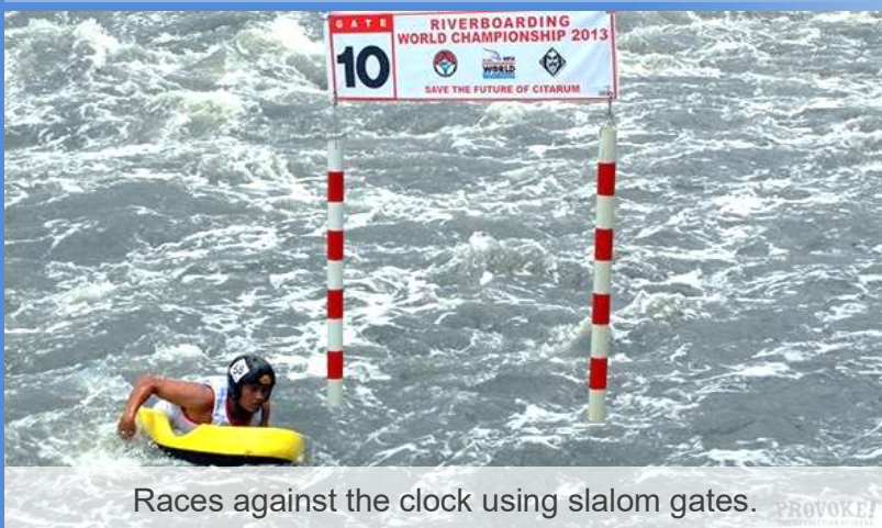
Races against the clock using slalom gates. PROVOKE!