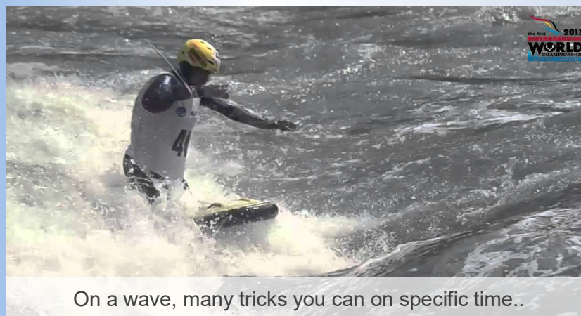
On a wave, many tricks you can on specific time..