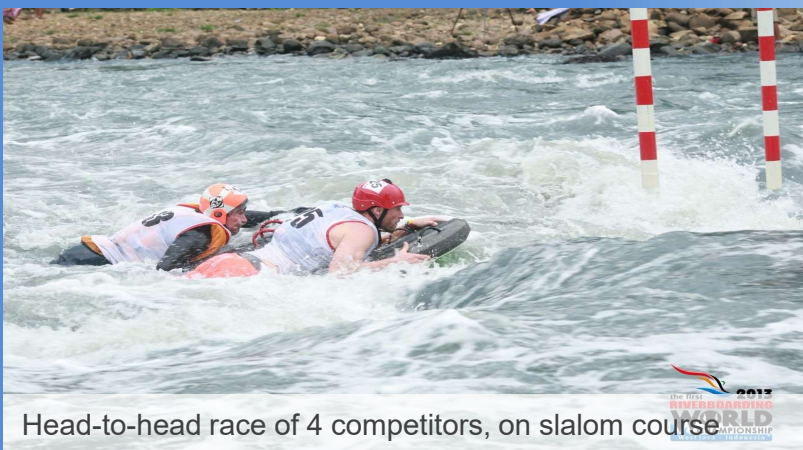
Head-to-head race of 4 competitors, on slalom course